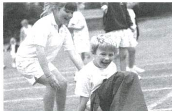
The morning sack race was a real hit.

Come lunchtime, the school field was full of local families, many enjoying picnics in the bright April sunshine.