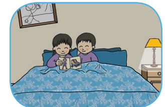
Read a bedtime story