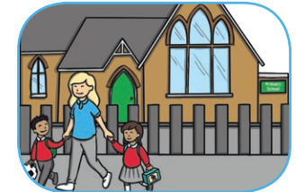
Come home from school