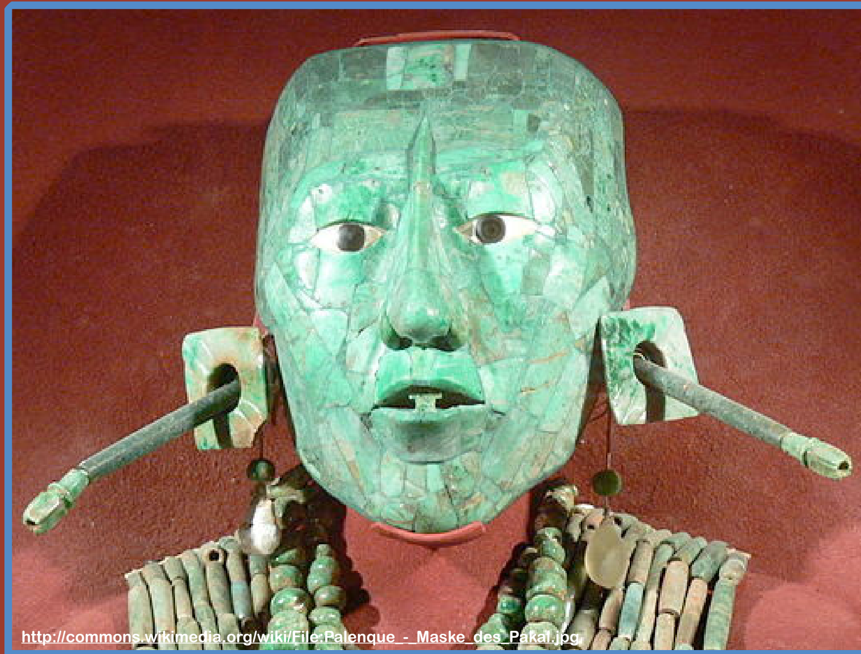
This is the funeral mask of King Pakal of Palenque.

They discovered many objects and artefacts that tell us about society and how these people lived.