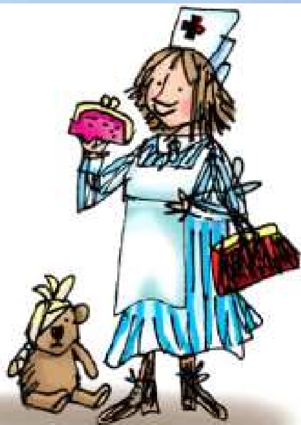
nurse with a purse