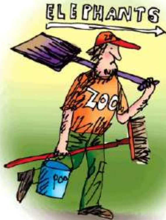
poo at the zoo