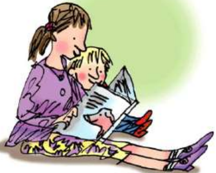
look at a book