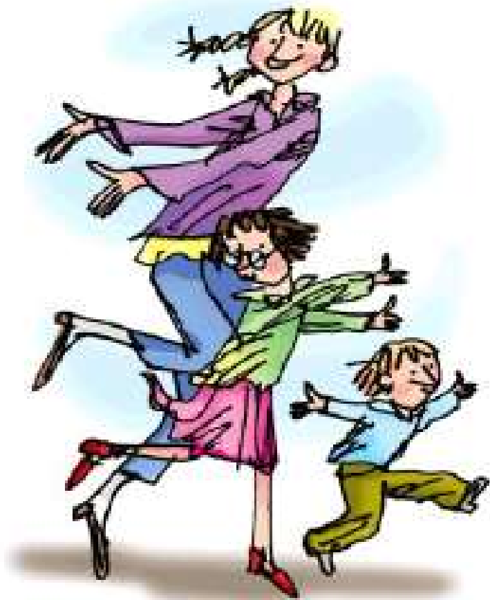
whirl and twirl