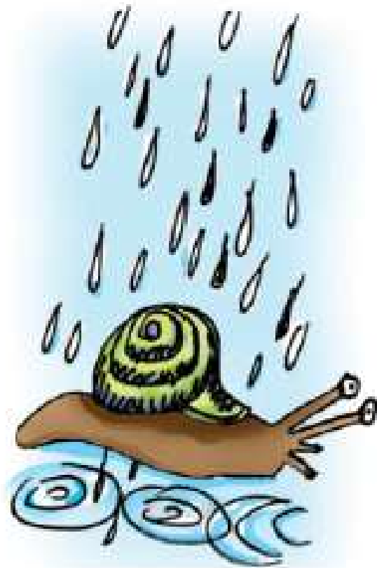
snail in the rain