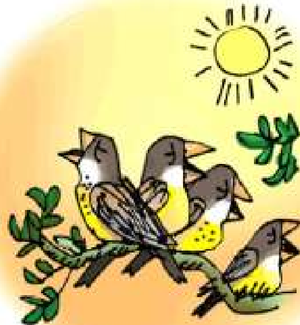
yawn at dawn