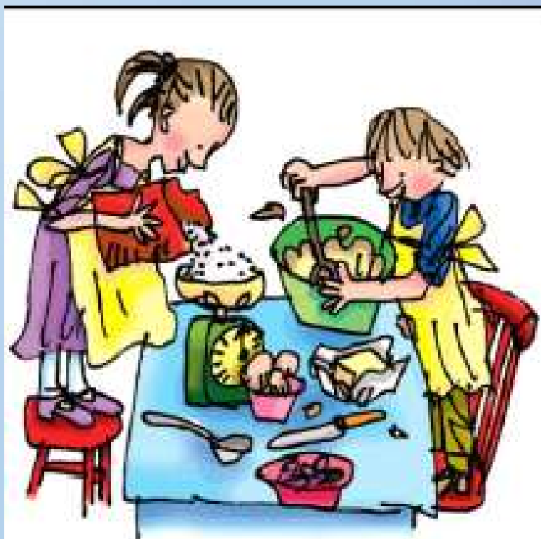
make a cake