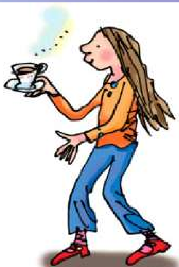
cup of tea