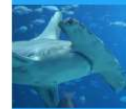
School of Hammerhead Sharks