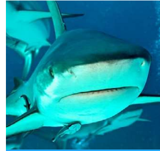
Grey Reef Shark

Smaller sharks eat small aquatic life like clams and crabs.