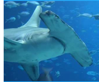
School of Hammerhead Sharks