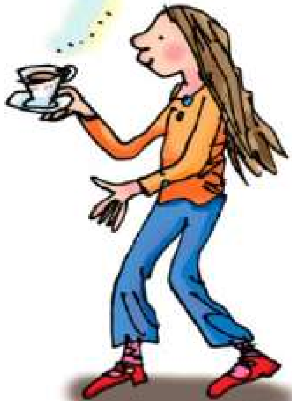
cup of tea