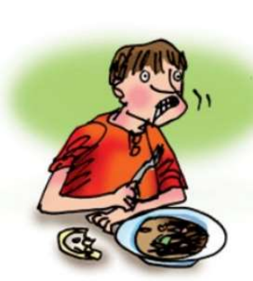
chew the stew